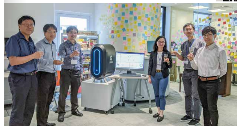
Ceremony for the first exhibition of a working quantum computer