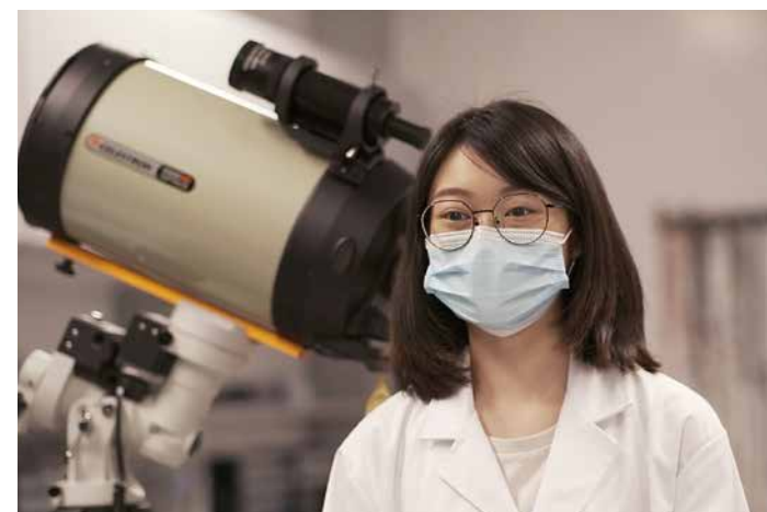
A PHYS student working under Prof. George Smoot (2006 Physics Nobel Laureate) on the development of a single-photon imaging detector in the Quantum Optics for Astrophysics and Cosmology Laboratory of HKUST

Internship at a secondary school – teaching physics to a class of high school students