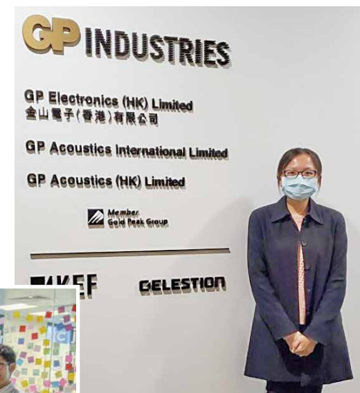
Internship at GP Electronics – developing hi-fi speakers in the engineering department