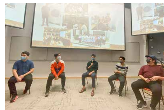
Summer internship sharing by the PHYS students