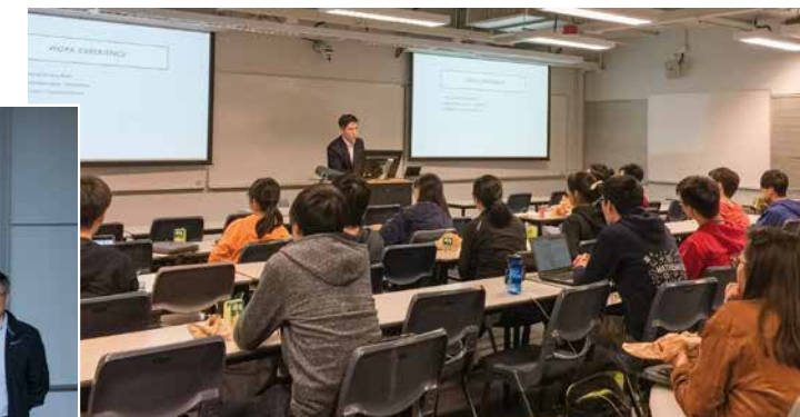
Career Training Alumni Sharing Session