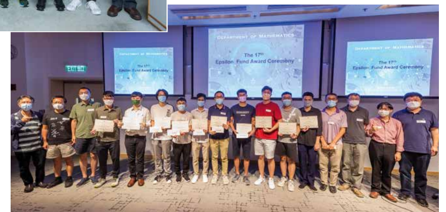
The Epsilon Fund Award Ceremony