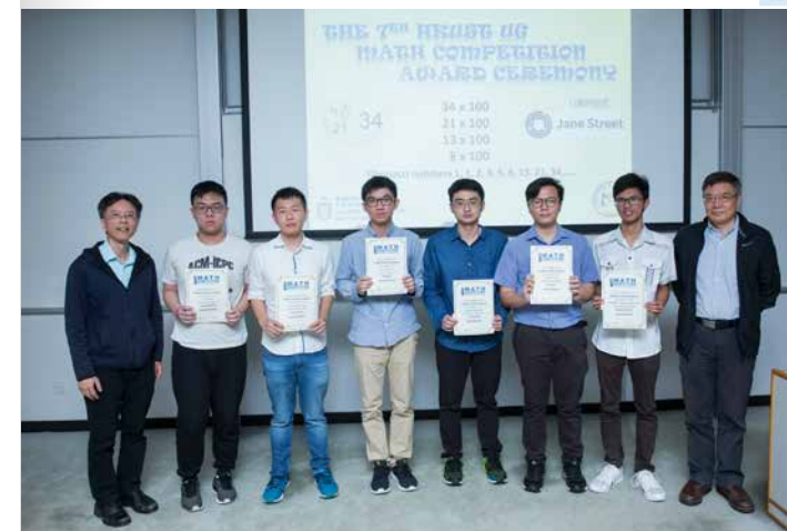
MATH Competition Award Ceremony