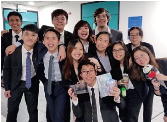
A MAEC student participated in an activity of Alpha Kappa Psi, one of the oldest and largest business fraternity.