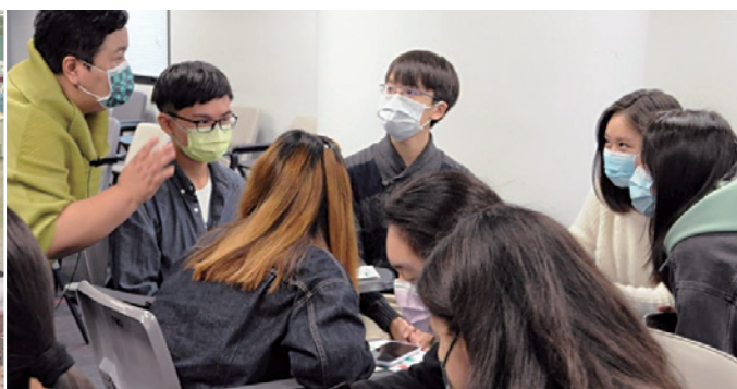
LIFS Professional Development Workshop