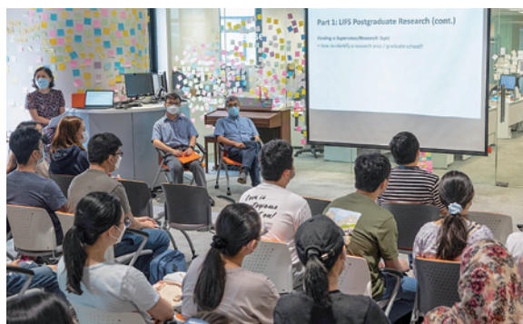
Focus Group Meeting - LIFS-related Postgraduate Research & Job Prospects